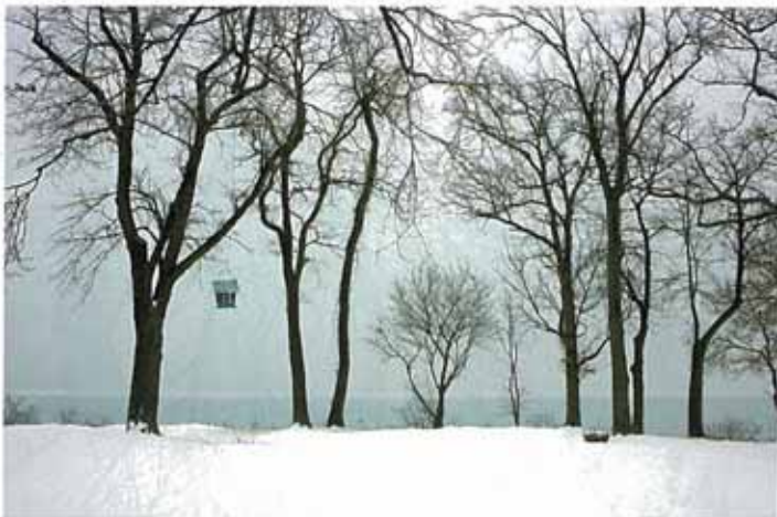
ABOVE Most of the property is landscaped naturalistically. Trees dot the lawn leading down to Lake Michigan. TOP Architectural details such as curved steel arbors and an antique fountain enhance the garden's classical look. CENTER Running alongside the house, the garden acts as a transition between the backyard pool area and the front drive.